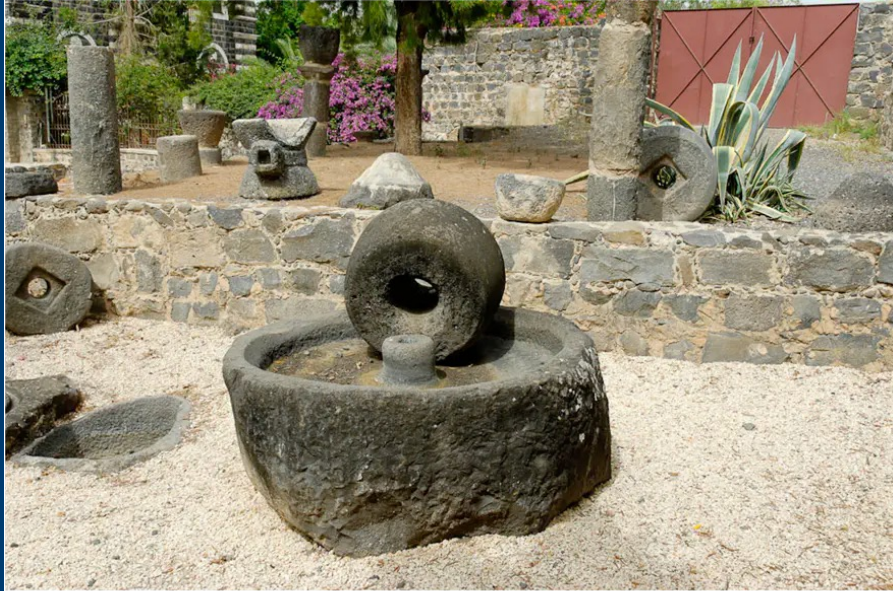
Basalt olive press at Capernaum