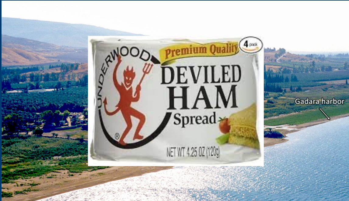
Area of Gadara harbor

And the herd rushed down the steep slope into the lake and were drowned