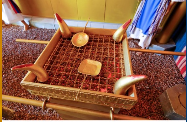
Tabernacle model incense altar