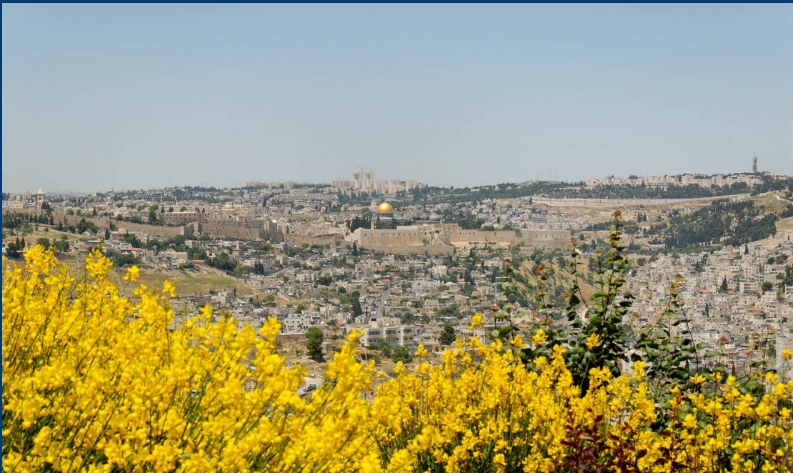
Jerusalem (from the south)

And Jerusalem will be trampled under foot by the Gentiles