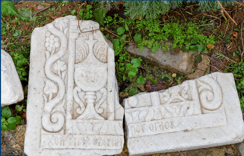
Philadelphia Church of St. John architectural fragment