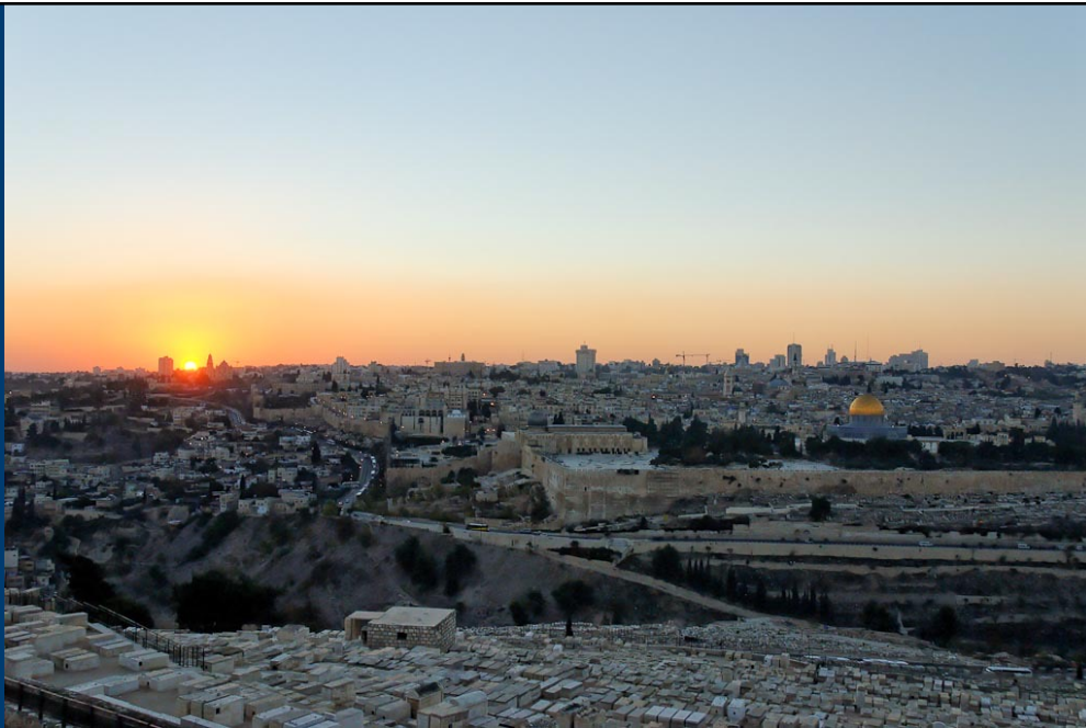
Sunset over Jerusalem from Mount of Olives