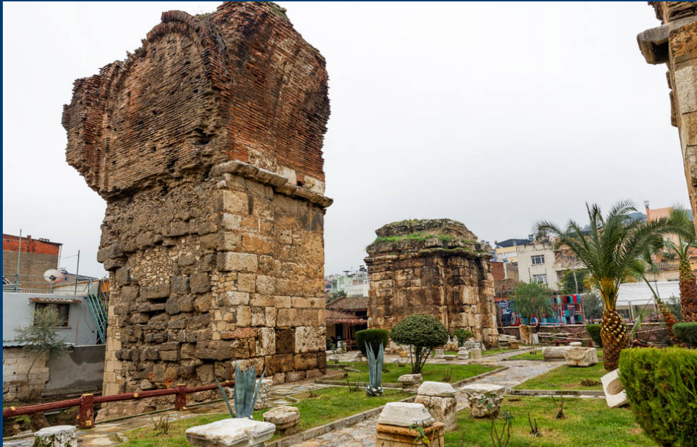
Philadelphia Church of St. John pillars