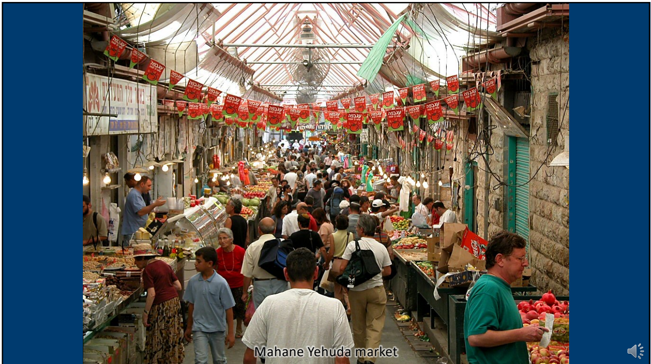
Mahane Yehuda market