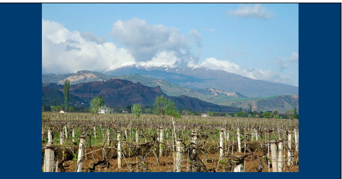
Snow-covered mountain west of Philadelphia