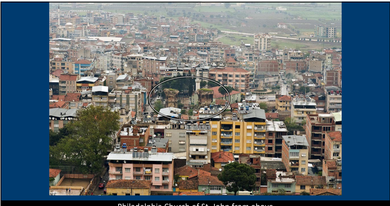
Philadelphia Church of St. John from above