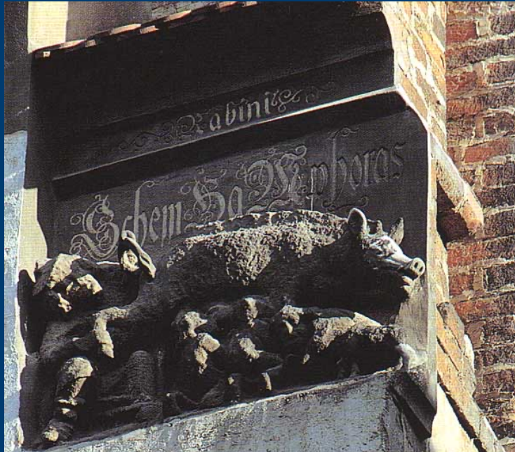
Judensau at Wittenberg Parish Church