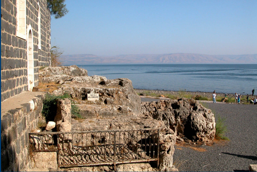
Traditional location where Jesus stood on the "sacred rock" at Heptapegon

Jesus stood on the shore; yet the disciples did not know that it was Jesus