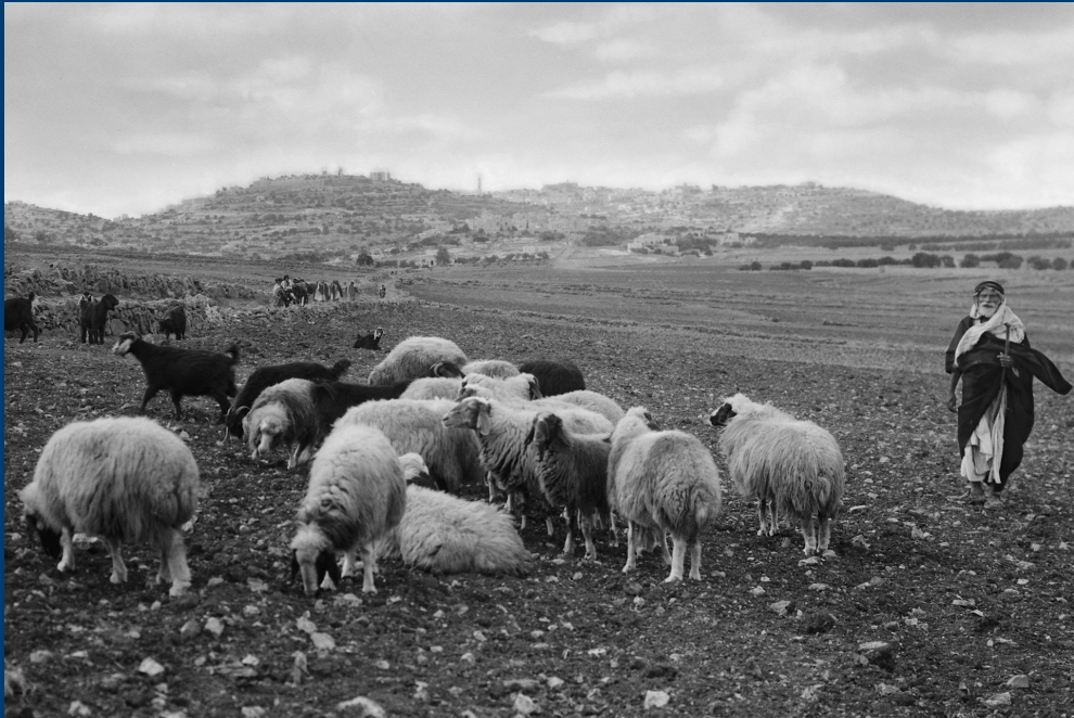
Shepherds' fields east of Bethlehem

Man looks on the outward appearance; the LORD looks on the heart.