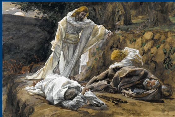
You Could Not Watch One Hour With Me , by James Tissot, circa 1890

Mar 14:38 Watch and pray that you may not enter into temptation. The spirit indeed is willing, but the flesh is weak."