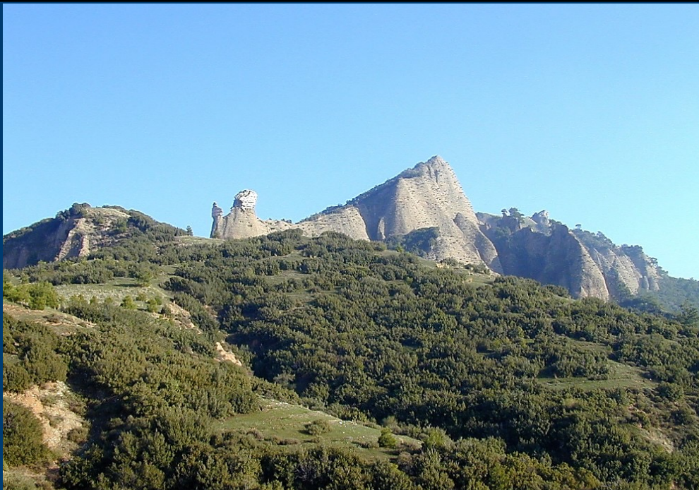
Sardis acropolis from below