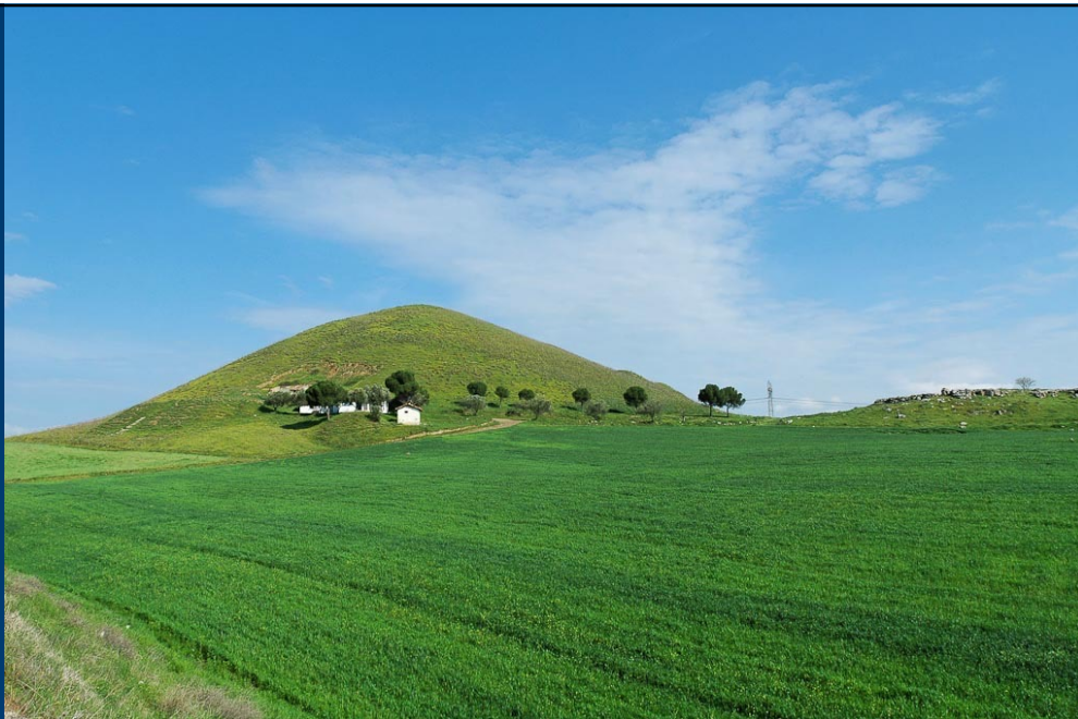
Sardis burial ground of biblical Gog