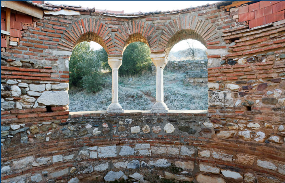
Sardis Byzantine chapel inside Temple of Artemis