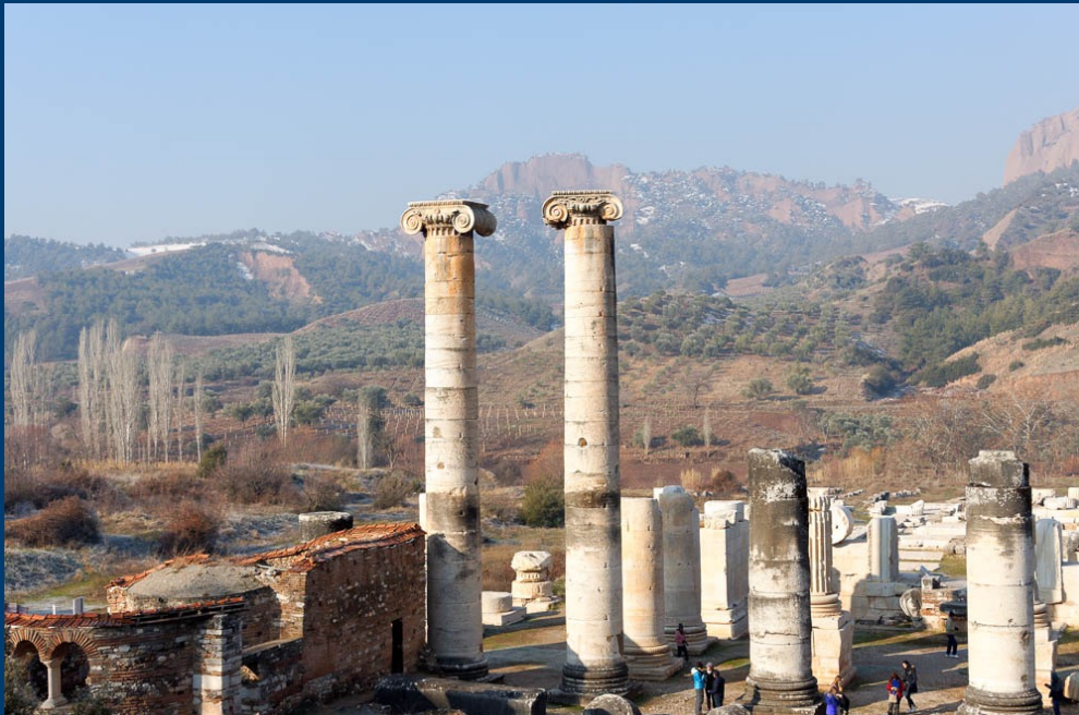
Sardis Temple of Artemis