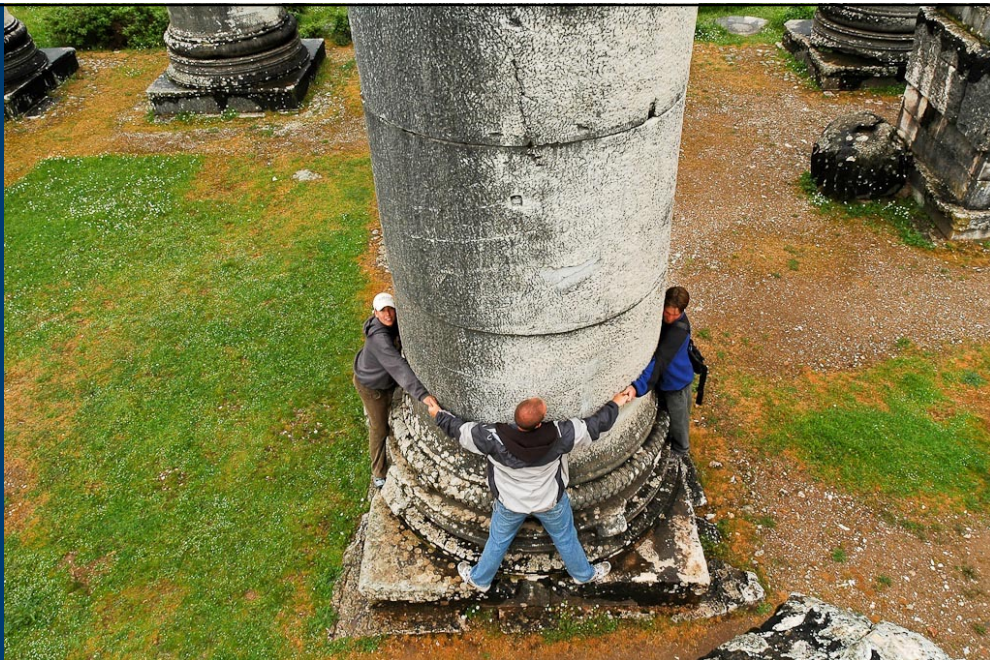
Sardis Temple of Artemis column circumference