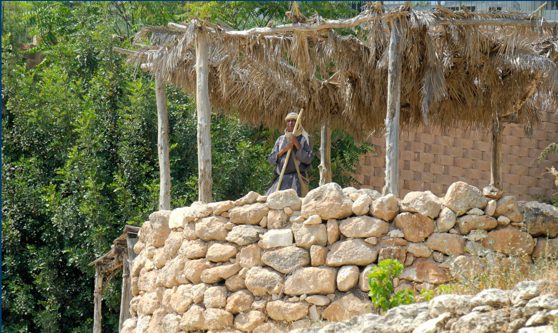
Shepherd on watchtower at Nazareth Village

Watch therefore: for you do not know on what day your Lord is coming