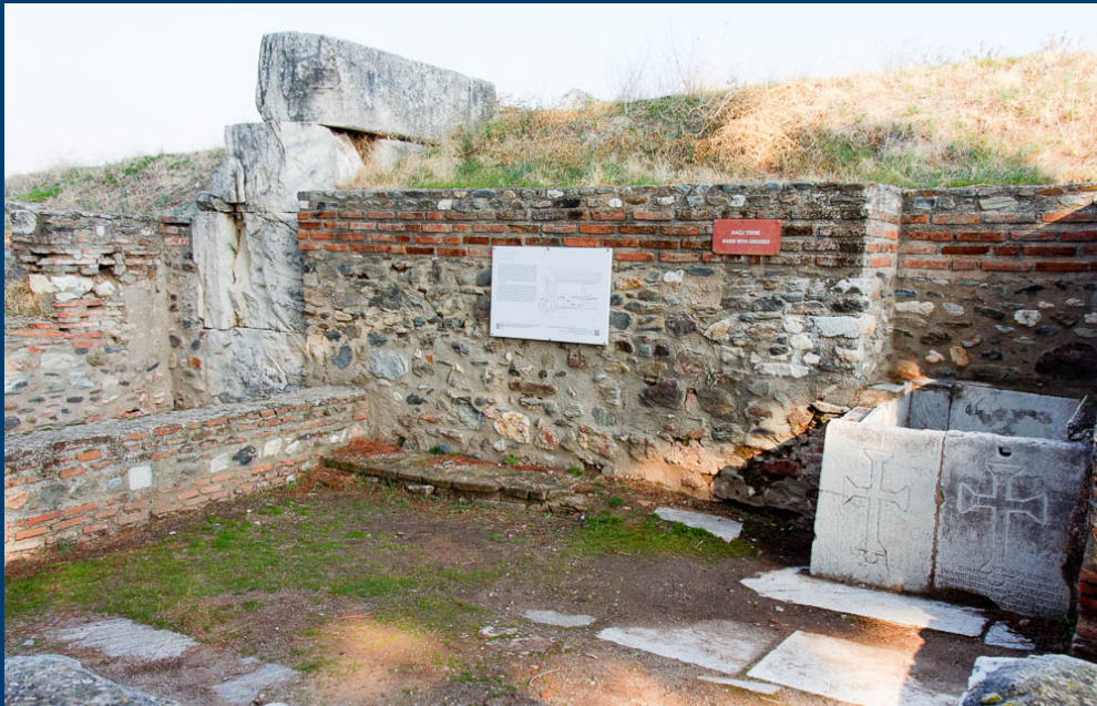
Sardis paint shop