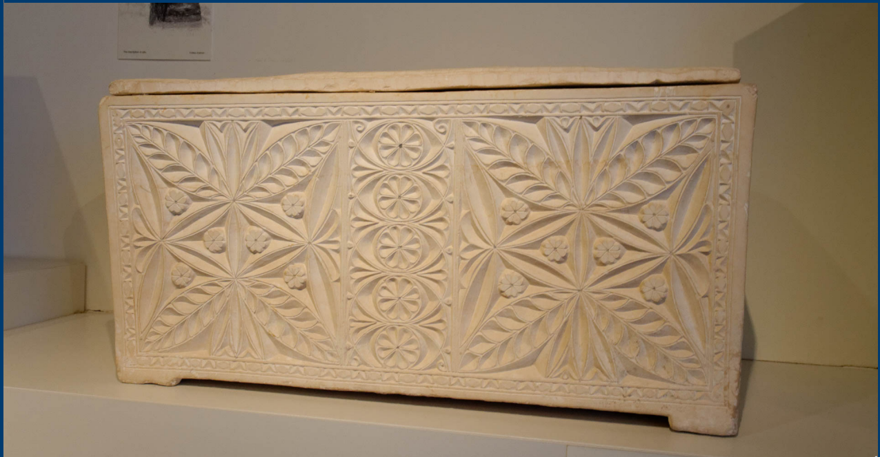
Ossuary with Aramaic inscription from Jerusalem, 1st century AD

You are like whitewashed tombs, which from the outside appear beautiful . . .