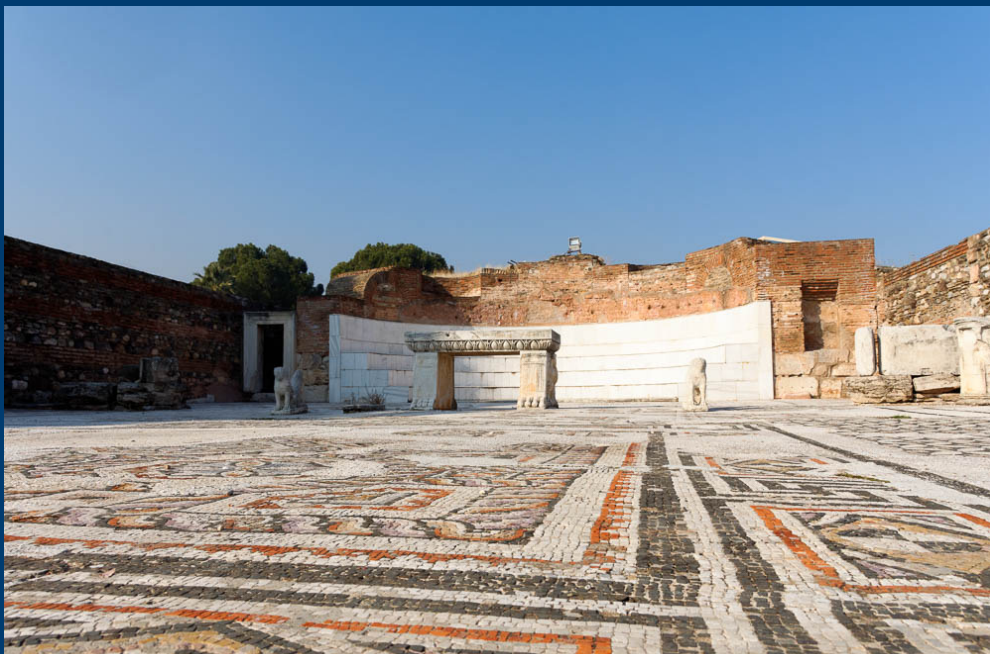
Sardis synagogue with mosaic floor, 4th century AD