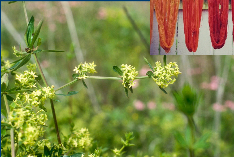
Flowering madder at Zichron Yaakov

A woman named Lydia, from the city of Thyatira, a seller of purple cloth