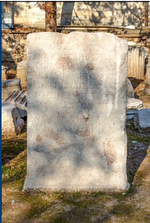
Thyatira Greek inscription mentioning wool workers