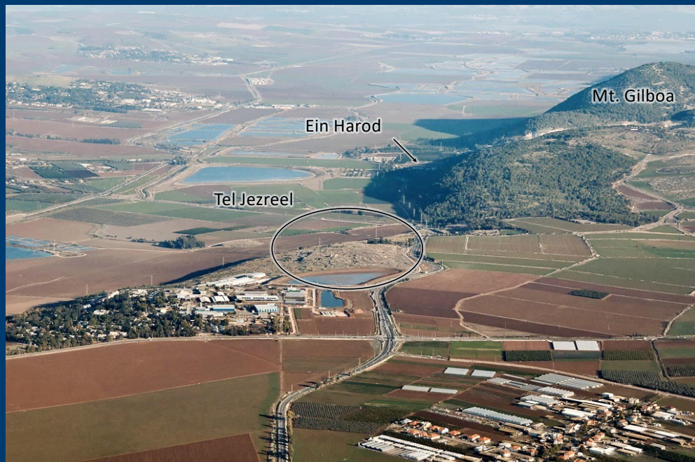
Tel Jezreel aerial from west