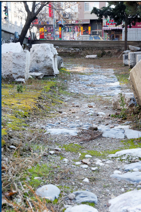
Thyatira Roman street