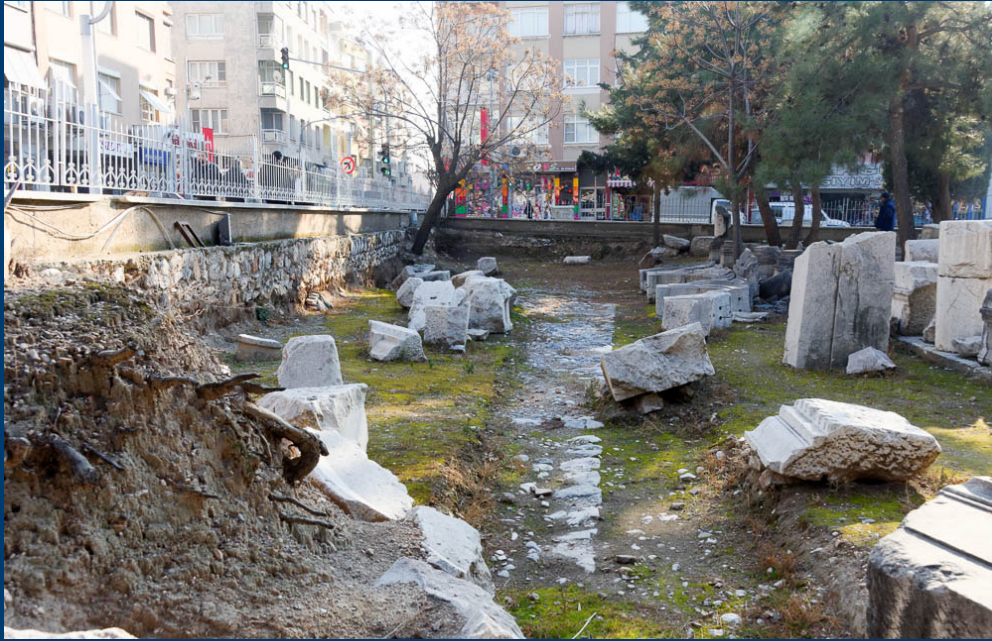
Thyatira colonnaded Roman street