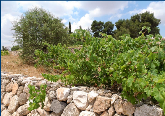
Tel Jezreel with grapevines

1Ki 21:1-23 Now Naboth the Jezreelite had a vineyard in Jezreel, beside the palace of Ahab king of Samaria. (2) And after this Ahab said to Naboth, "Give me your vineyard, that I may have it for a vegetable garden, because it is near my house, and I will give you a better vineyard for it; or, if it seems good to you, I will give you its value in money." (3) But Naboth said to Ahab, "The LORD forbid that I should give you the inheritance of my fathers." (4) And Ahab went into his house vexed and sullen because of what Naboth the Jezreelite had said to him, for he had said, "I will not give you the inheritance of my fathers." And he lay down on his bed and turned away his face and would eat no food. (5) But Jezebel, his wife, came to him and said to him, "Why is your spirit so vexed that you eat no food?" (6) And he said to her, "Because I spoke to Naboth the Jezreelite and said to him, 'Give me your vineyard for money, or else, if it please you, I will give you another vineyard for it.' And he answered, 'I will not give you my vineyard.'" (7) And Jezebel, his wife, said to him, "Do you now govern Israel? Arise and eat bread and let your heart be cheerful; I will give you the vineyard of Naboth the Jezreelite."