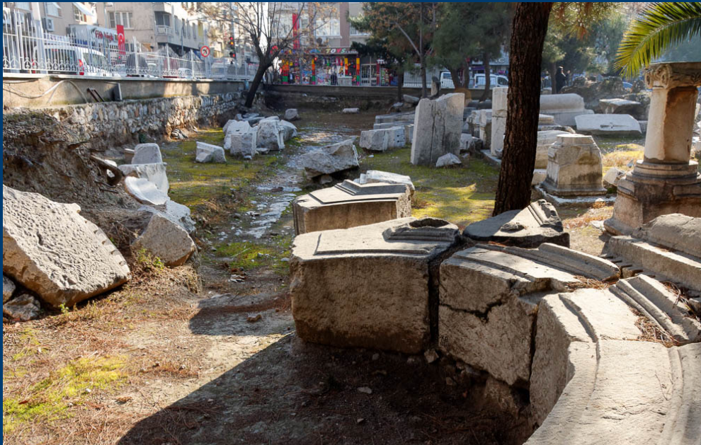
Thyatira arch along colonnaded Roman street