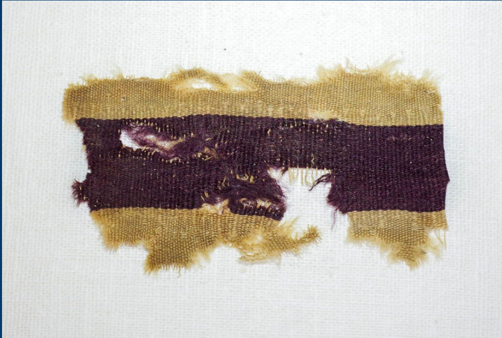
Wool textile with purple stripe, made with vegetal indigotin and madder, 132-136 AD

A woman named Lydia, from the city of Thyatira, a seller of purple cloth