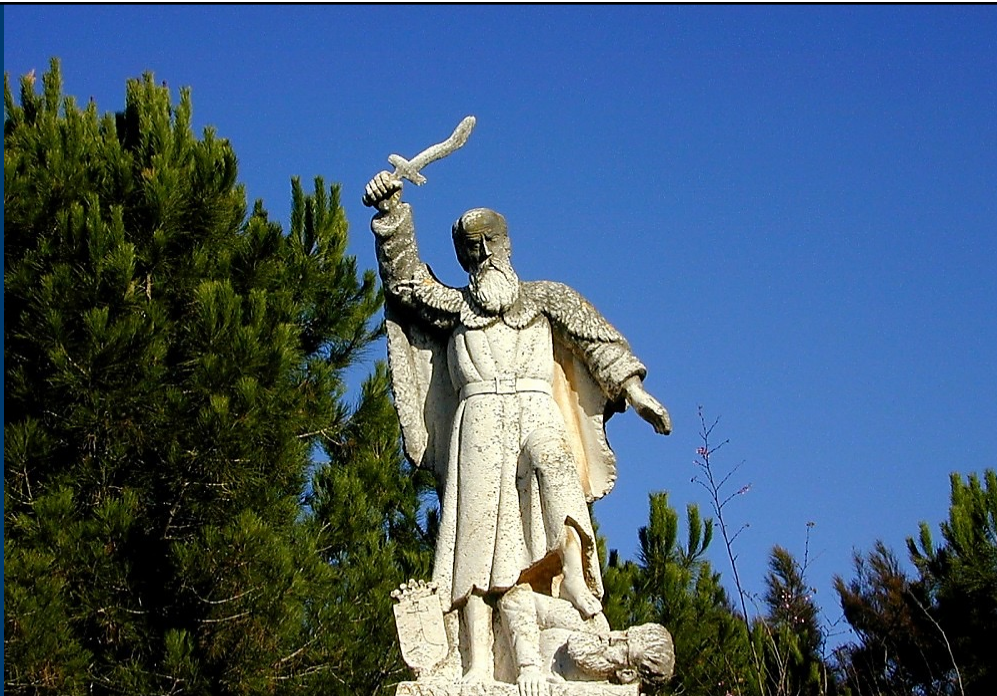
Muhraqa statue of Elijah on Mount Carmel