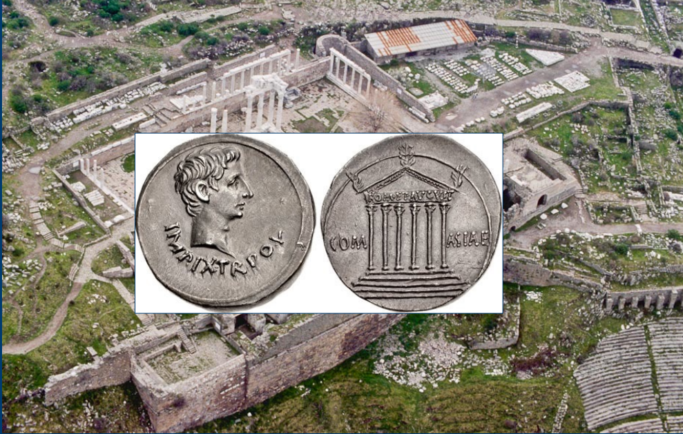
Pergamum acropolis Trajan temple aerial

"Pergamum became the center of the official religion of emperor worship."