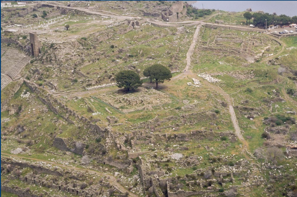
Pergamum acropolis great altar of Zeus