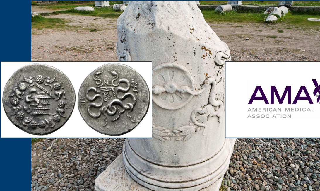
Pergamum Asclepiion snake on column base