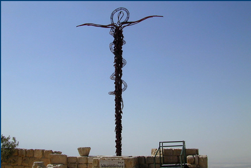
Serpent symbol on Mount Nebo

As Moses lifted up the serpent in the wilderness