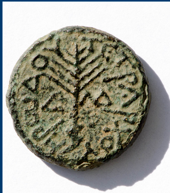
Bronze coin of Herod Antipas, AD 30/31, from the Tiberias mint