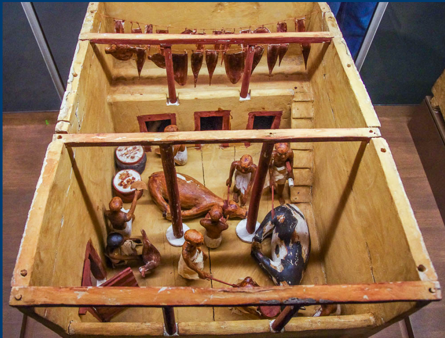
Men collecting blood in bowls, from the Tomb of Meketre in el-Asasif, circa 1980 BC

That they abstain . . . from what has been strangled and from blood